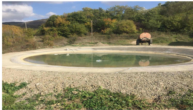
Fig. 3. The sight of the basin ( own research )

After finishing the topping, the prepared surface is watered. After drainage, the basin is filled with water for testing. After testing, when we are sure that filtration of floor and slopes is absent, the basin is emptied (by siphon or other method) and the surface of the floor and slopes is covered with large stones so that the anti-filtration layer is not damaged by people or animals during operation.