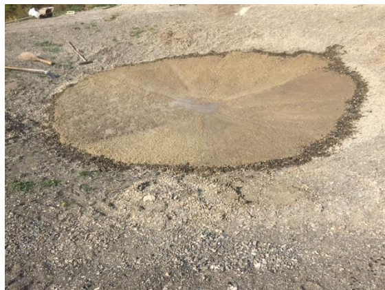
Fig. 1. A small basin to provide the cattle with drinking water in highlands ( own research )

“Natlen” waterproofing material can be used for collecting water in mountain regions. In particular, it can be used for the construction of small basins (500-1000 m 3 ), for the collection of precipitation waters in highland pastures and to provide drinking water for cattle (Fig. 1).