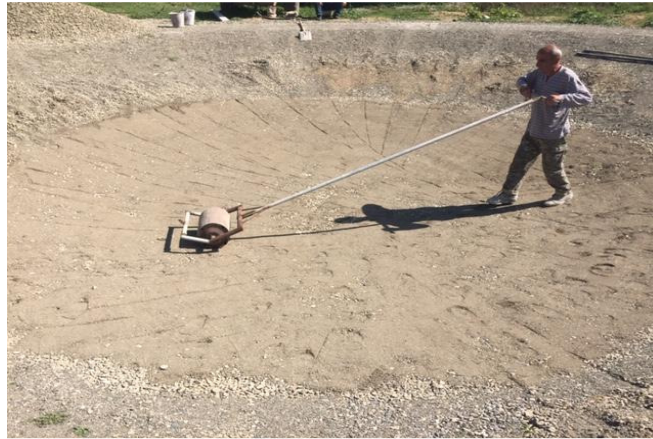
Fig. 2. Topping of the basin floor ( own research )

The authors suggested building such basins in the form of a cut cone. The angle of inclination of the slopes to the horizon should not exceed 25-27°. In order to protect the “Natlen” waterproofing material during operation, coarse gravel or, more preferably, lustrous river stones should be used. Apply a 5 cm thick lustrous layer of gravel on a 5 cm thick sand pillar and top. Then fill in the waterproofing material and continue topping (Fig. 2). The final site of the basin is given in Figure 3.