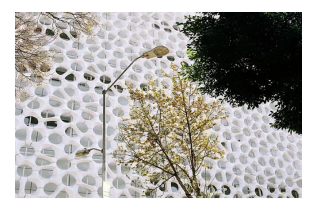
Fig. 2. Hospital building Torre de Especialidades (Mexico City)

Prosolve370e panels, designed by the German company Elegant Embellishments, and based on the Alcoa technology created in 2011, were mounted on the building of the Torre de Especialidades Hospital (Mexico City) (Fig. 2). The material contains titanium dioxide, which effectively purifies the air from toxins and other harmful substances.