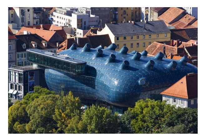
Fig. 3. Kunsthaus Museum of Contemporary Art (Graz, Austria) (https://ru.wikipedia.org)

Buildings with such facades are becoming more common with the further development of technology and increased efficiency of photovoltaic modules. Though this a topic that should probably be reviewed in a separate article, we will give one (perhaps, somewhat shocking) example – the Kunsthaus Museum of Contemporary Art (Fig. 3) in the city of Graz (Austria) (https://ru.wikipedia.org).