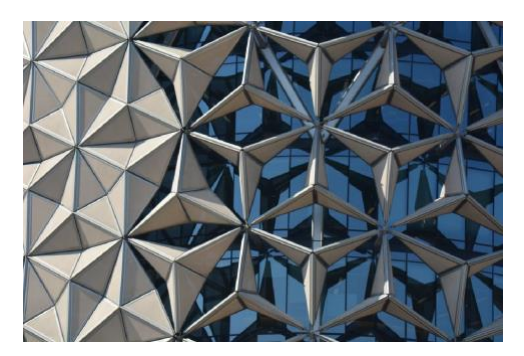
Fig. 9. Fragment of the facade of the Al Bahr Tower in the UAE (https://arttravelblog.ru/dostoprimechatelnosti/bashni-bliznecy-al-baxar-v-abu-dabi-oae.html)

During the design and construction of the Al Bahr Towers in the UAE (https://arttravelblog.ru/dostoprimechatelnosti/bashni-bliznecy-al-baxar-v-abu-dabi-oae.html) (Fig. 9), the goal was set to create, regardless of the extreme heat conditions, a comfortable indoor microclimate without the consumption of large amounts of power.