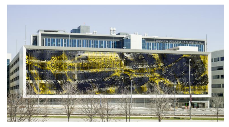
Fig. 5. The building of Eskenazi Hospital (Indianapolis, USA) (http://architime.ru/specarch/rob_ley/eskenazi_hospital.htm)

and cars pass by the building. To achieve the desired effect, panels of different sizes were used, each set at a certain angle. The selected color scheme was fairly simple: one side of the panels was painted in golden yellow, and the other in dark blue. But thanks to the angles of inclination of the surfaces and the reflection of light, an illusion of various shades is created, which makes the spectrum of colors much more diverse (Fig. 5).