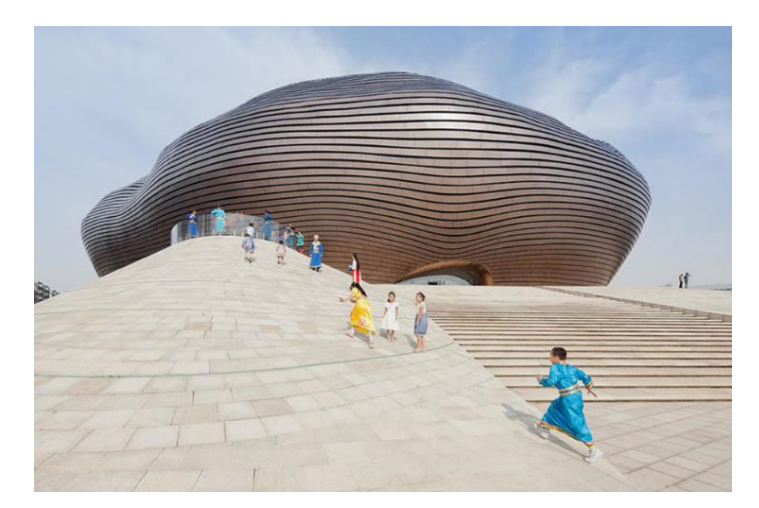
Fig. 4. Art Museum of Ordos (China) (https://novate.ru/blogs/240911/18848/)

The surface of the building consists of polished and curving metal louver panels that help the Ordos Museum to resist the harsh desert climate and frequent sandstorms. The natural light penetrates through the glass roof and spreads through the building using reflective walls, and the blinds provide natural ventilation.