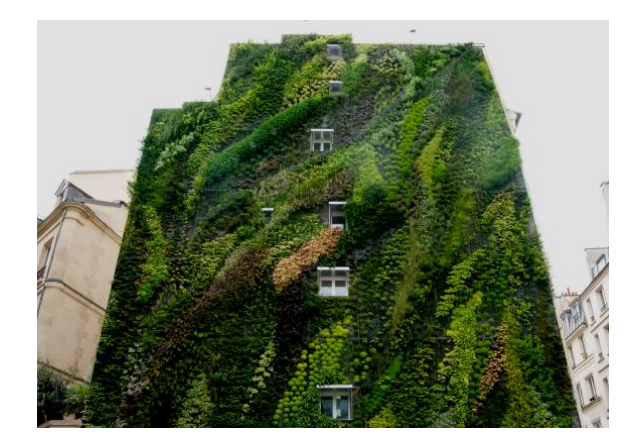
Fig. 1. Vertical garden (Spain, Madrid) (http://www.earthtimes.org)

Of course, such an exotic example (Fig. 1) is unlikely to be widely used due to our climatic conditions, exceptions would be the Crimea and the Krasnodar Region. But in the southern regions of Europe such buildings are appearing more and more.