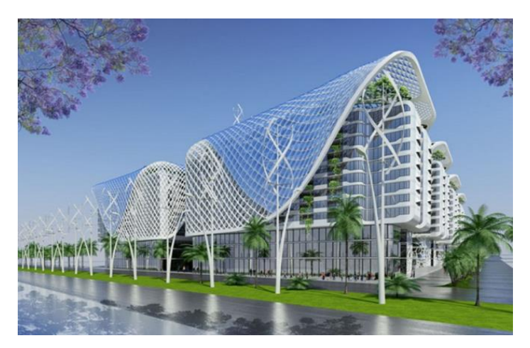
Fig. 6. "The Gate Residence" Project (https://aasarchitecture.com) (Egypt)

they break the plane of the wall, giving the building additional expressiveness. Thus, the Kolding campus building is equipped with a sun protection system that adapts to specific climatic conditions.