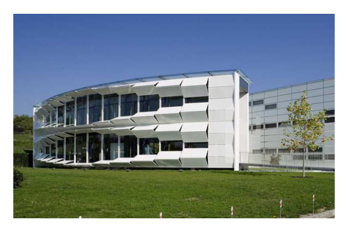
Fig. 8. The Kiefer Technic Building (Steiermark, Austria) (https://www.archdaily.com/89270/kiefer-technic-showroom-ernst-giselbrecht-partner)

During the design and construction of the Al Bahr Towers in the UAE (https://arttravelblog.ru/dostoprimechatelnosti/bashni-bliznecy-al-baxar-v-abu-dabi-oae.html) (Fig. 9), the goal was set to create, regardless of the extreme heat conditions, a comfortable indoor microclimate without the consumption of large amounts of power.