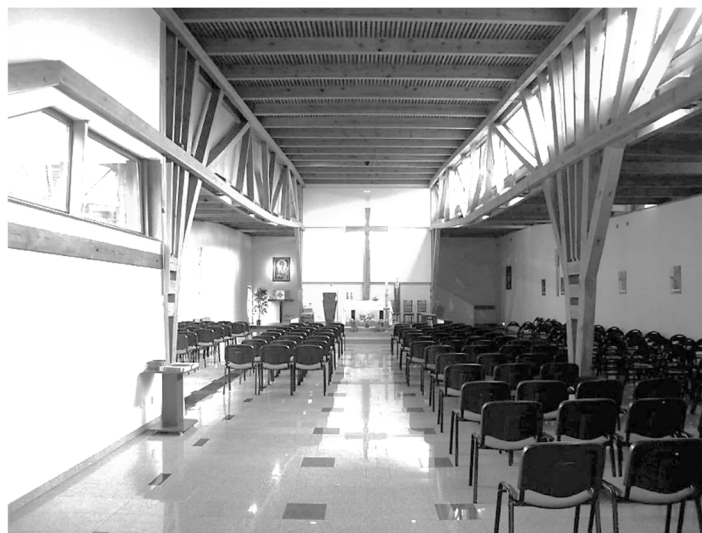
Fig. 3. Personal Academic Parish Church

The building is designed in a three-nave system perpendicular to Kilińskiego Street. The three-nave division of the chapel emphasises the space of the presbytery with the altar, mensa and rostrum. The central part of the nave is crowned in the upper zone by a belt of wooden windows which raise the roof structure above the side naves. Its construction is supported by branching wooden pillars, which like the boughs of trees penetrate the structure of the roof. The form of the wooden pillars subtly separates the main nave from the side naves (Fig. 3).