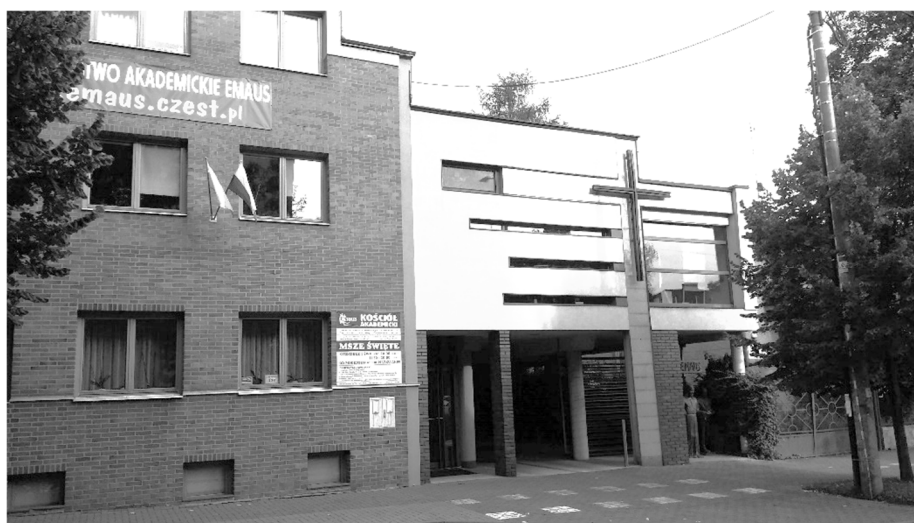
Fig. 1. Personal Academic Parish Church. Adapted parish building (left) and the newly designed chapel building (right)

The sacral complex was designed as a continuation of Kilińskiego Street, referring to the existing building conditions. The context of the surroundings made it necessary to create a simple compact mass with the main facade parallel to the street (Fig. 1).