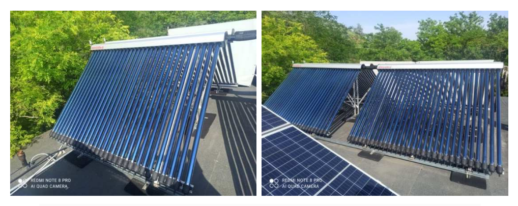
Fig. 4. Vacuum solar collectors for heating water on the roof of the educational and health complex

The air-to-water heat pumps are additionally installed to compensate loads on the solar system, as well as for uninterrupted hot water supply in cloudy weather (Fig. 5).