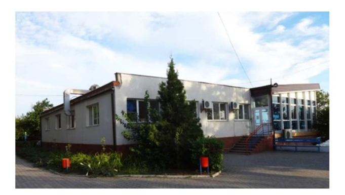
Fig. 3. Dining room establishment