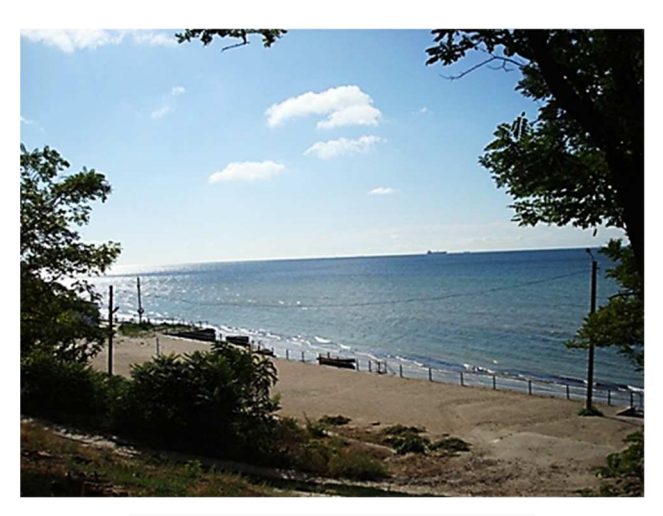
Fig. 2. Location on the beach