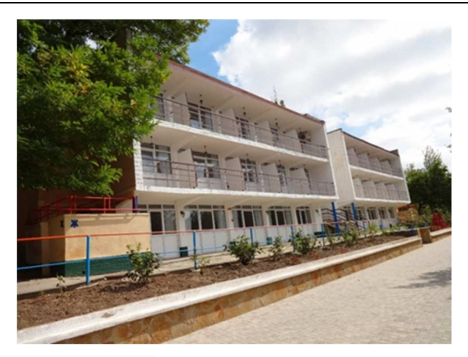
Fig. 1. Residential building of the educational and health complex