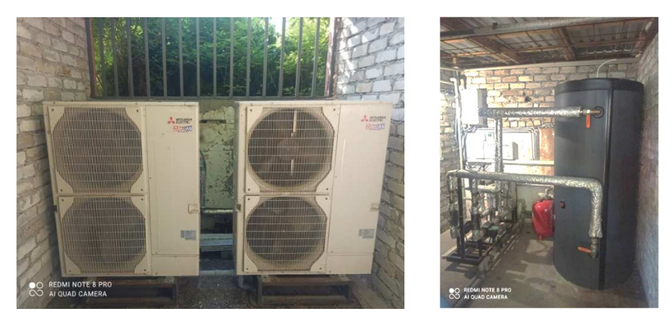
Fig. 5. Air-to-water heat pumps