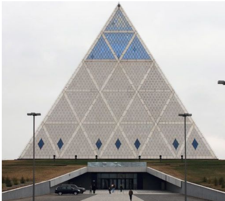
Fig. 1. Perspective of the Palace of Peace and Concord, Astana

“The Palace of Peace and Concord” is widely known by the unofficial name of “Foster’s Pyramid”. The artistic image of the building in the form of a pyramid reveals a regional picture of the world: the square base (61.8x61.8 metres) symbolises the earth, while the top of the pyramid represents heaven, eternity (Figs. 1 and 2). Compositionally, the structure expresses the idea of the centre of the universe and the unity of different religions.