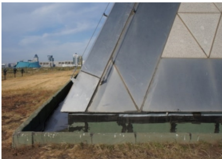
Fig. 2. Structural unit of the building's movements

The Pyramid's architecture uses innovative techniques that have placed it at the forefront of modern construction: British engineers used unique movable articulated structures at the base of the pyramid, capable of responding to seasonal temperature variations by contracting and uncompressing with an amplitude of 6 cm.