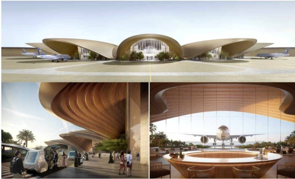
Fig. 4. The Red Sea Airport, by Foster + Partners, Hanak, Tabuk, Saudi Arabia (official representative of Foster + Partners Architects)

Norman Foster's studio aims for the airport to achieve a LEED Platinum sustainability rating. The airport will be run 100% from renewable energy sources, both during construction and in the future: zero-use of disposable plastic will be implemented during operation.